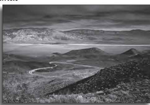
Father Crowley Point, Death Valley