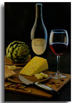
Wine and Cheese